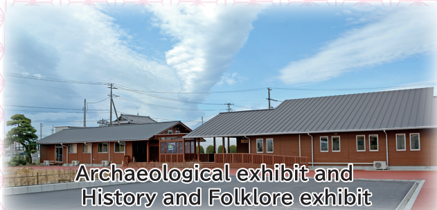
Archaeological exhibit and History and Folklore exhibit