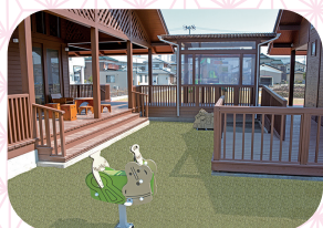
Small Play Area